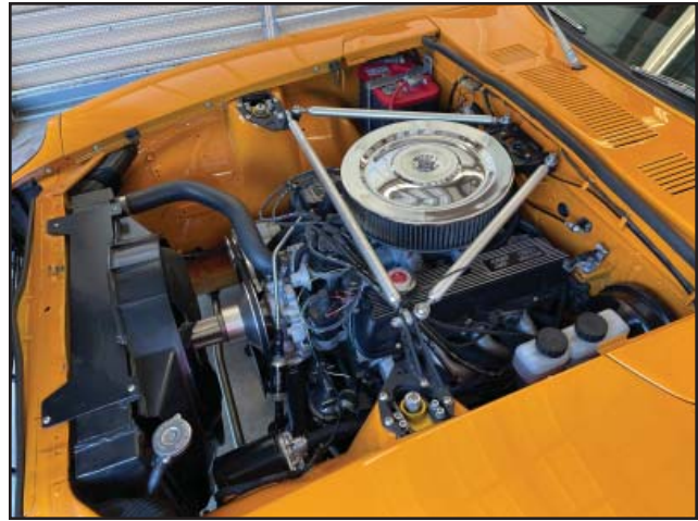
This somewhat ordinary-looking Datsun 240Z had a wonderful secret, in the form of a Ford Small-block V8! The installation was as sanitary as they come, and the car was easily as fast as the fastest current-production Mustangs

blocks to pick up a neighbor who has a spectacular collection of over 60 collectible motorcycles but who knows nothing about cars, and together we rolled in to Sears Point right at the crack of nine, to find a show field already rapidly filling up with interesting cars. There were many late-model Mustangs and Shelby Mustangs, and another row of 1960s and 1970s Shelby Mustangs, Mach 1s and Boss Mustangs. This year they invited antique cars, and there were four Model