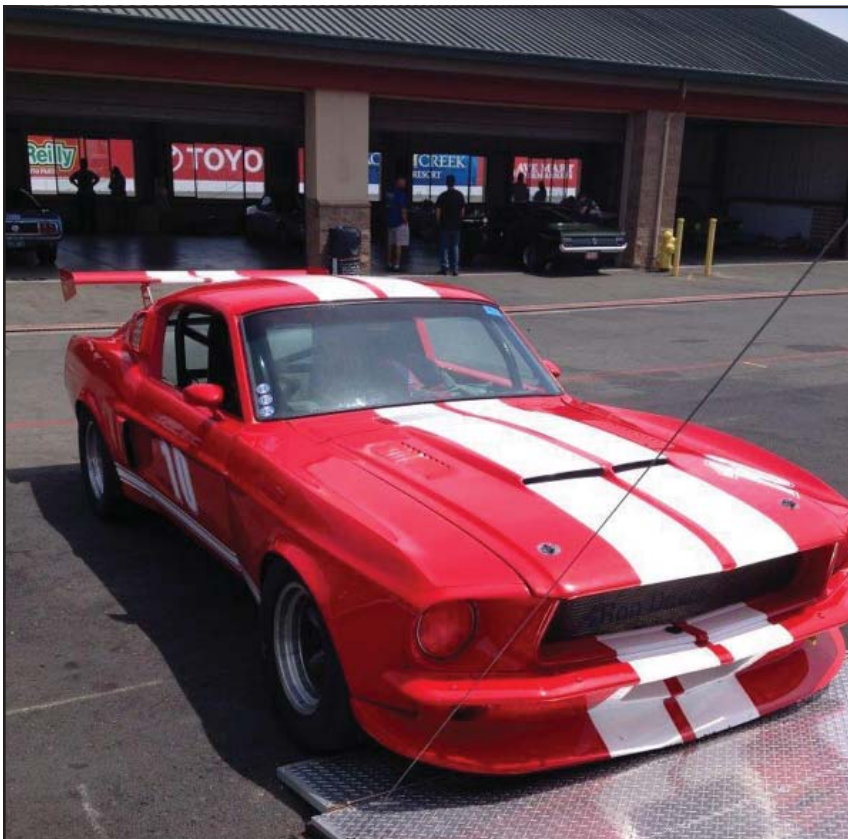
Chad Aanensen drove his radically modified classic Mustang

Afterwards we drifted around the paddock, checking out the various track cars, along with the vendor display. Carroll Shelby Engines is located in Windsor, CA, near Santa Rosa, and they brought a full car trailer filled with display engines, ranging from traditional small-block Fords built with a bit of modern tech, to the latest examples