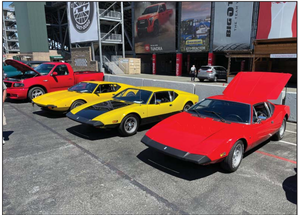
PCNC put forth a small but enthusiastic collection of Panteras to complement the Shelbys and other high-performance Fords on display

Each year, the Nor-Cal Shelby Club stages their own two-day convention, whose agenda broadly mirrors the national Shelby American Automobile Club's National meet. As theirs is a miniature version of the national event, they elected to call it Mini Nats. The event is centered around two days of open track, but also features vendor displays, a banquet, and a car show. (This year they staged an autocross for the first time as well). Panteras and other De Tomaso cars have always been welcome under the Shelby umbrella, and they issued a special