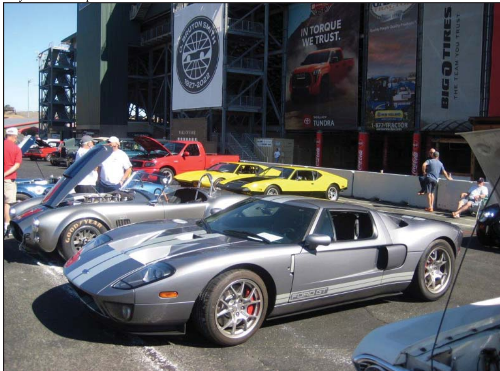
Tom Leonard had his beautiful Ford GT surrounded by 427 Cobra replicas

invitation to PCNC for our members to display our cars in the Sunday morning show.