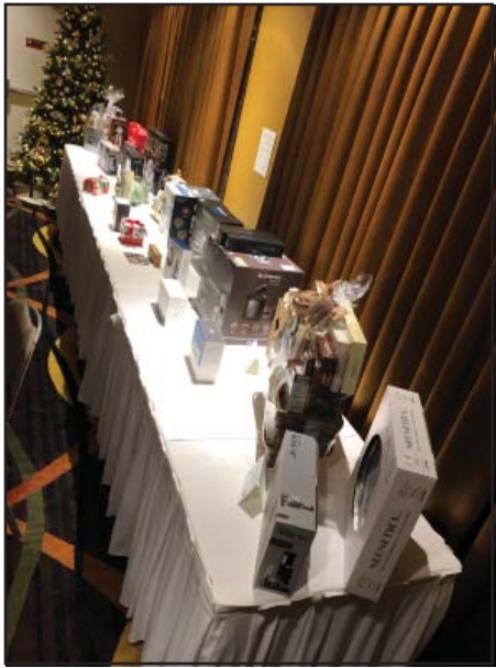
Brent secured a vast array of raffle prizes from vendors and club members