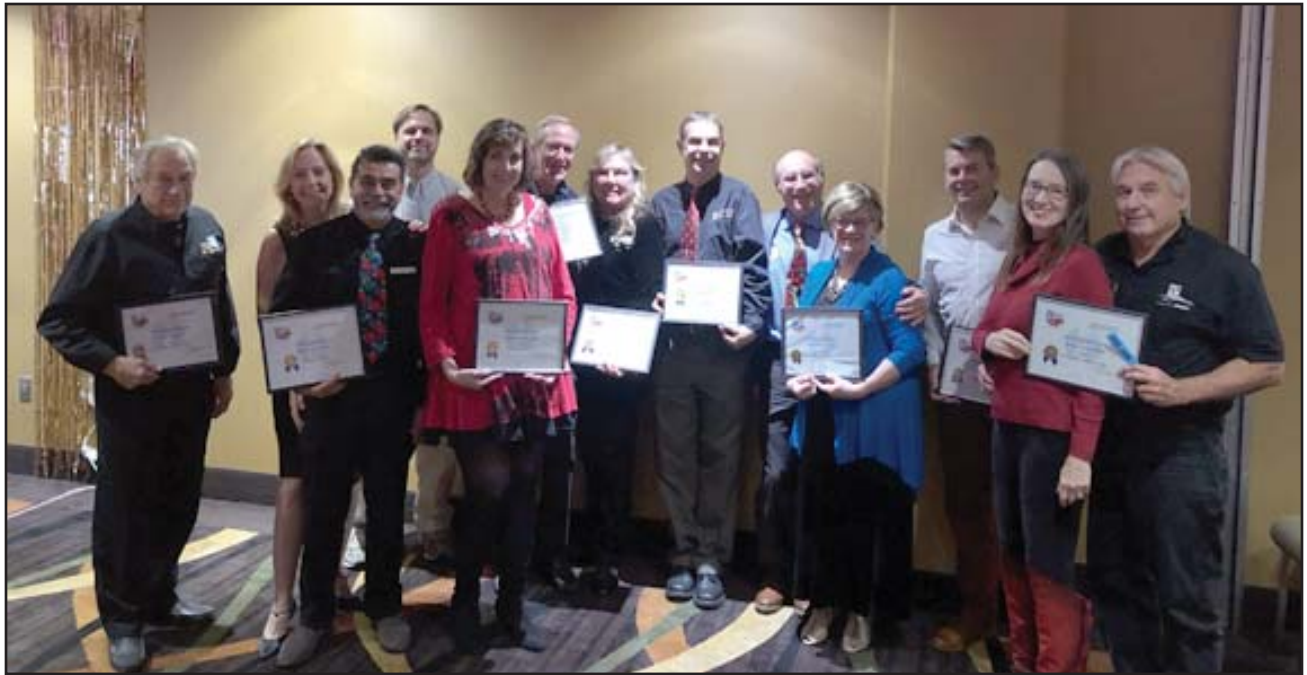
After all the event organizers and award winners were recognized individually, they were all brought up together to be recognized as a group