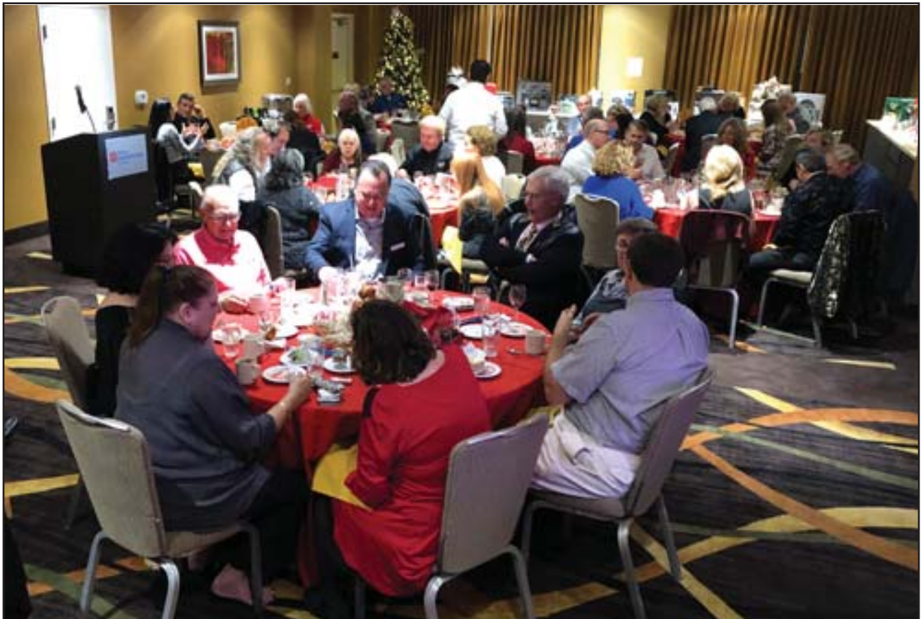
The dining room was filled to capacity with PCNC revelers celebrating the holiday season

Pantera and everything else they own, and pulled up stakes and moved to a new life in Hawaii. We are certainly sad to see them go, and hope they will maintain their ties to the club even though they no longer live here or