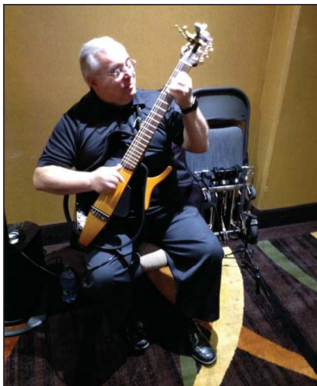
During the cocktail hour, we were serenaded by beautiful Italian music