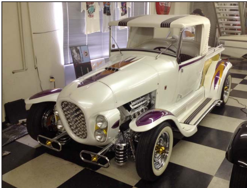
George Barris of Barris Kustoms built the Ala Kart, a legendary hot rod

been featured in dozens of magazine articles since. It was widely acknowledged at the time as being one of the most iconic hot rods ever built, and in 1961 was the subject of a 1/25 AMT model kit which became one of the best-selling models of all time. It was also issued as a Hot Wheels car, and featured in countless period movies, usually in the background of drive-in shots. It won over 200 trophies during its years as a show car, and for a time was on display at the Henry Ford museum in Dearborn.