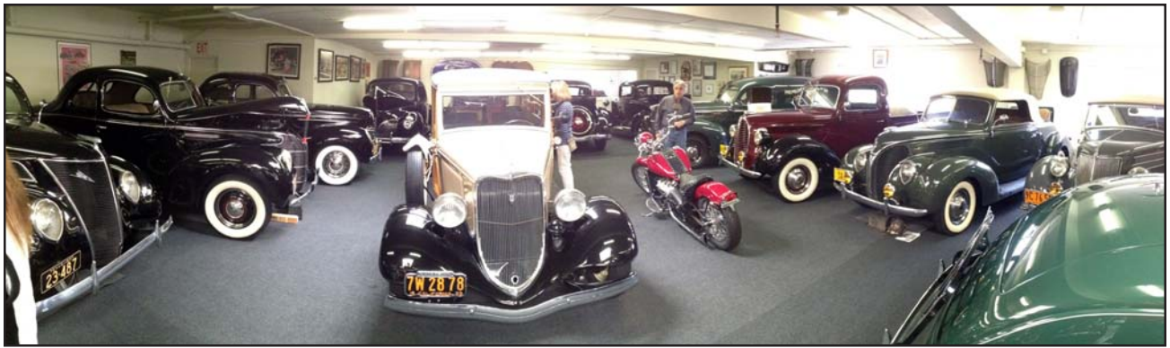
Post-war Fords of every description filled a portion of the upper level