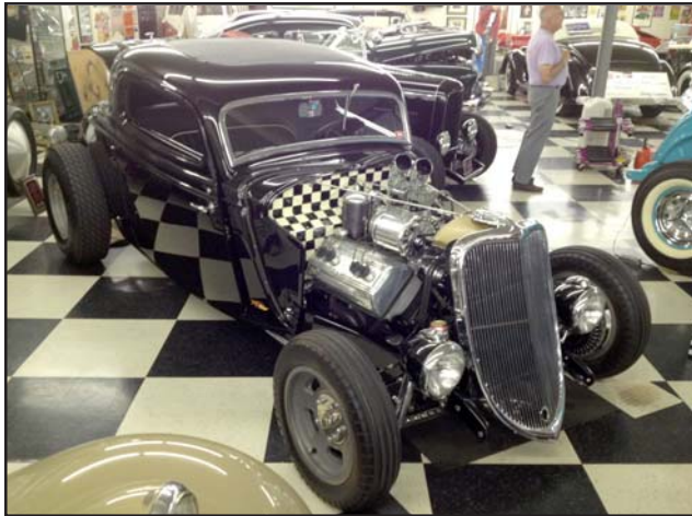
Blown Ardu-head '33 Ford 3-window coupe