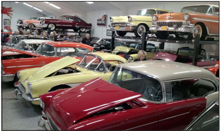
This shows less than half of the GM room, which is filled with noteworthy examples from the various GM brands

We then trooped around to the other building, which is much larger and focuses on John's real passion—classic Fords, and Ford hot rods. This building has a mezzanine filled with even more cars (the total collection numbers some 150 cars or thereabouts). The ground floor is filled with street