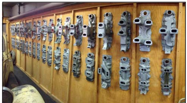
Three walls were hung with almost 100 different and unique high-performance intake manifolds just for the Ford flathead engine!