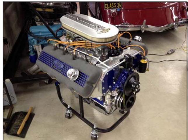
A corner of the Ford building was dedicated to a collection of ultra-high-performance Ford engines, with the most significant being the 427 Single Overhead Cam (SOHC). Designed to compete in NASCAR, and immediately banned, it features iron heads with mirror-image overhead camshafts, driven by a timing chain that is nearly seven feet long! It saw great success in NHRA drag racing