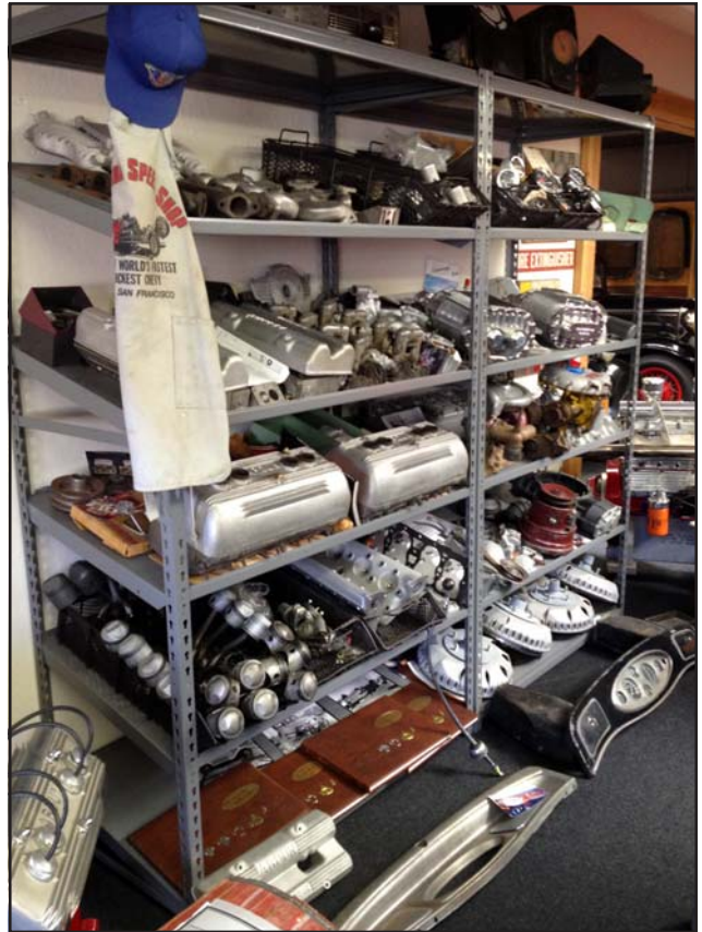
Racks contained all sorts of rare and esoteric parts including one of only eight sets of Ardu V8-60 cylinder heads