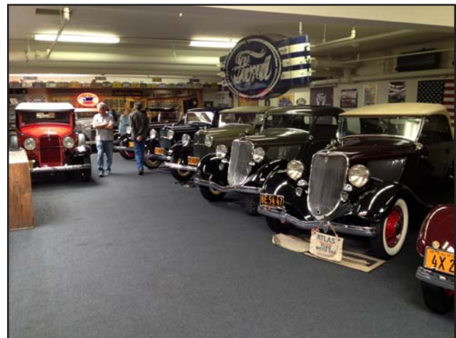
The upstairs featured a wide variety of very stock, original Model A Fords, which were produced in many styles