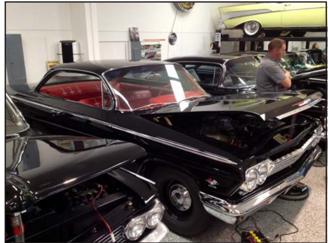
Super Stock drag racing was a big thing in the early 1960s, with all the manufacturers building special lightweight versions of their production sedans, equipped with ever-more-powerful big-block engines, aluminum bodywork and bumpers, thinner glass, and with fripperies such as heaters, insulation, carpeting and so forth deleted. On the left is a 1962 Pontiac 421 Super Duty, and on the right the competing 1962 Cheverolet 409