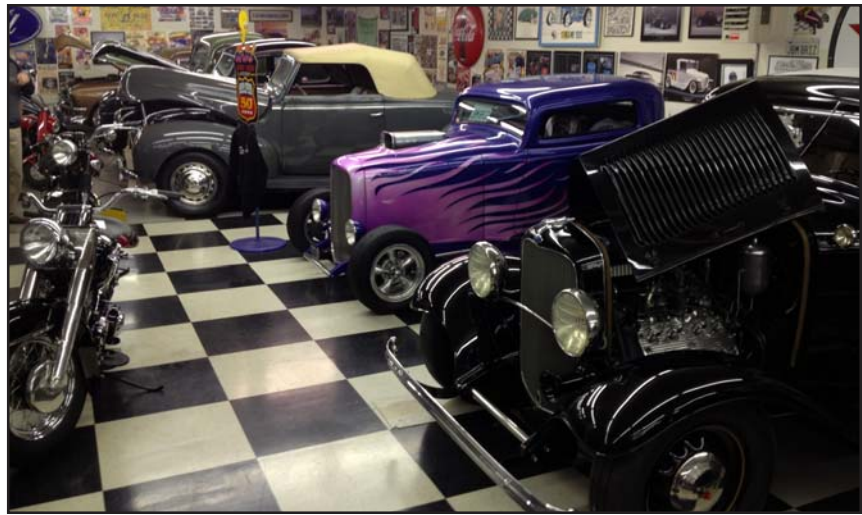
The ground floor of the Ford building was filled with a wide variety of pre- and post-war Ford hot rods

Two of the world's most significant Hot Rods appear in the collection. The first is the Ala Kart, built by George Barris, which was the winner of the 1958 and 1959 America's Most Beautiful Roadster (AMBR) award, the highest honor that can be bestowed on a hot rod. It was on the cover of the 1958 issue of Hot Rod magazine, and has