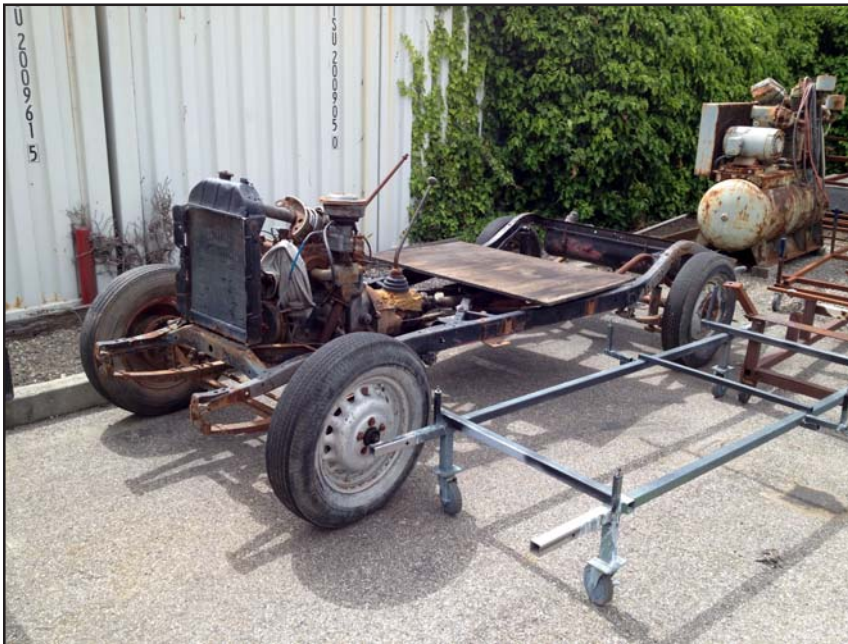
It's hard to believe, but most Brizio creations start with something as humble as this. True artisans then create some of the finest hot rods in the world

mises, and the Brizio guys look after his collection. He has also been a prolific customer, and has commissioned numerous builds from them.