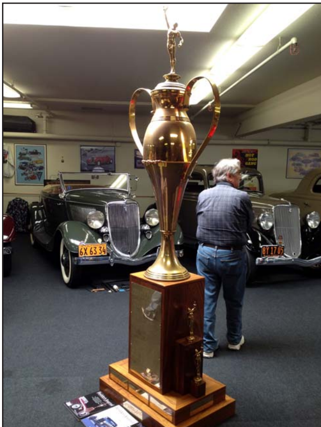
Mumford comissioned a replica of the AMBR trophy