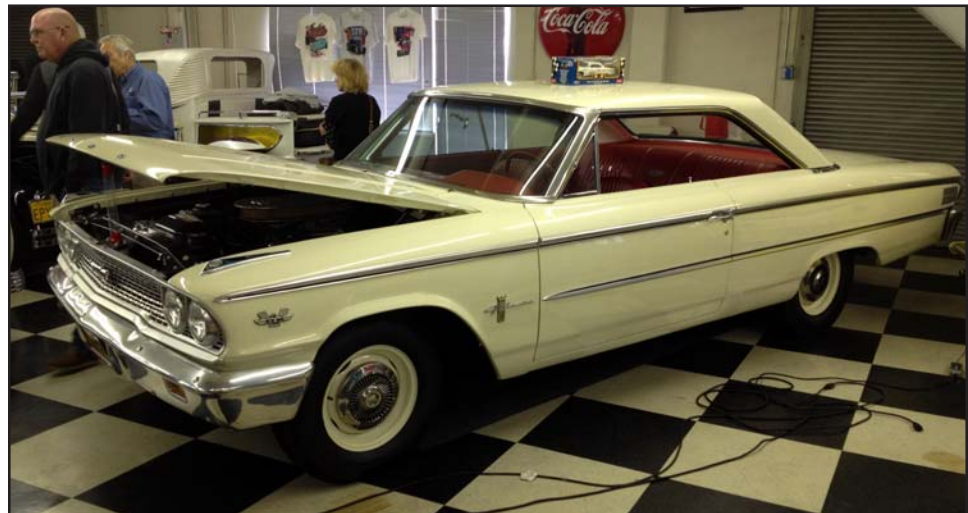
Ford build their own limited run of stripper drag cars, including this 427 side-oiler-powered 1963 Galaxie 500