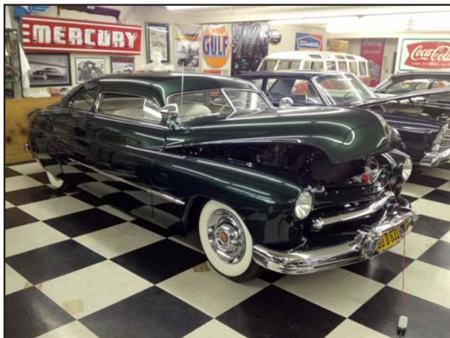
The very first chopped 1949-50 Mercury, built in 1950 by hot rod pioneer Sam Barris, George's older brother