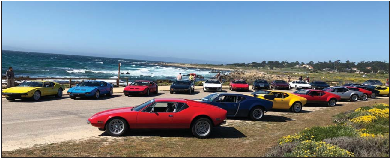
The famed 17-mile drive offered a spectacular backdrop for our group of Panteras

2014, and its restoration has been turned over to Canepa. It was fascinating to see the GT40 laid completely bare, just a naked tub. Because it led a quiet life in the USA and has been stored for so long in a dry environment, it only has a fraction of the rust that can often plague these cars, which were built for racing with no thoughts of rust protection, and thus are known to rust ferociously.