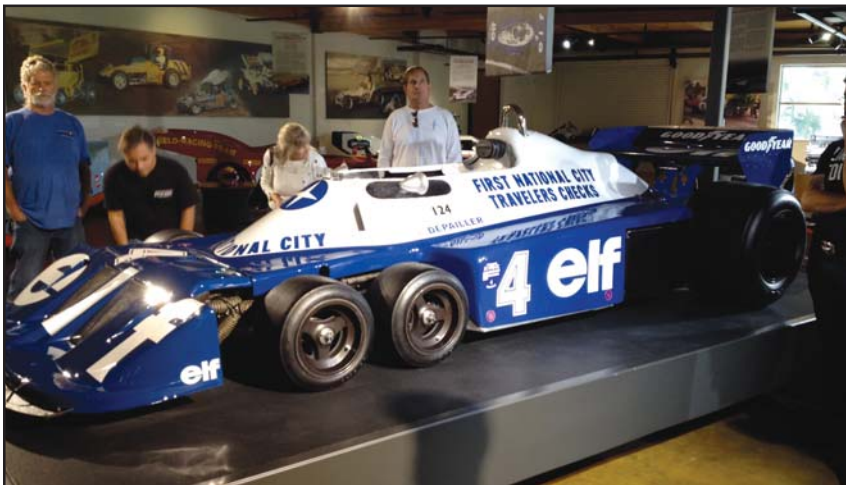
The legendary 1976-77 Tyrrell P34 six-wheeler Formula 1 car was an innovative design, using four smaller front wheels to lower overall drag and improve speed on straights, and clean up the aerodynamics so the rear wing would receive cleaner airflow. It always struggled to be competitive, and ultimately it proved to be an engineering cul-de-sac and the idea was abandoned