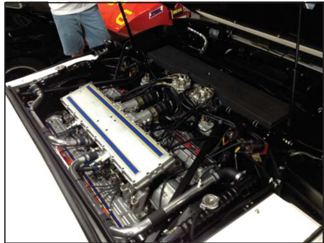
Without a doubt the rarest car in the workshop was this early 1990s Cizeta-Moroder V16T. Launched by a creative group of ex-Lamborghini employees, and styled by Gandini, it came onto the market just in time for the huge supercar crash. Designed to be the ultimate expression of the Italian supercar, it is powered by a 16-cylinder 7-liter engine (actually two 3.5 liter Lamborghini Urraco V-8s in a single cast block). Only about a dozen were built between 1991 and 1995 when the company moved to Los Angeles, and two more were completed in 1999 and 2003