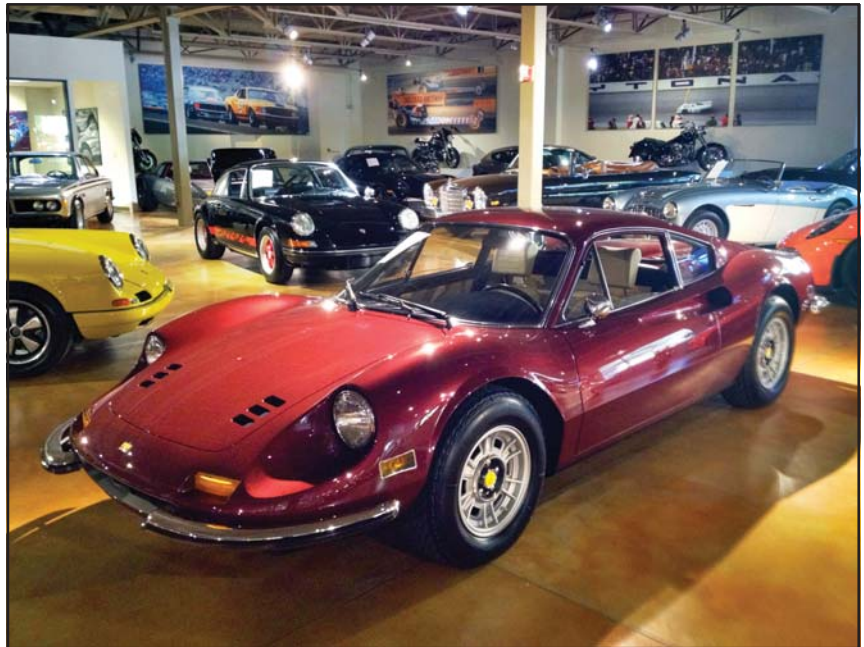
Among the numerous collectible and exotic cars for sale was this lovely ruby red 246 GTB Dino coupe

showroom and museum, before a docent took us on a guided tour of the restoration facility. Among the amazing cars undergoing restoration was a fa-