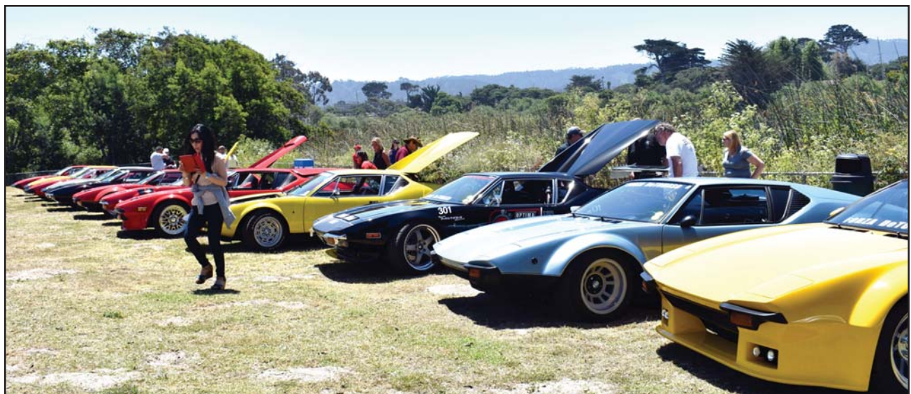
All the Panteras were parked side-by-side in Laguna Grande Park for the car show and awards ceremony

ally of a type where one would happily pay for them to put clothes back on, rather than off! So no matter what one's perspective might have been of the idea, there was general unhappiness. Some were offended by the entire notion (and compared the move with the infamous stand-up comedian disaster of the 2017 Fun Rally), while others who were a bit more old-fashioned and were looking forward to it were disappointed at the low caliber of the women on offer. No