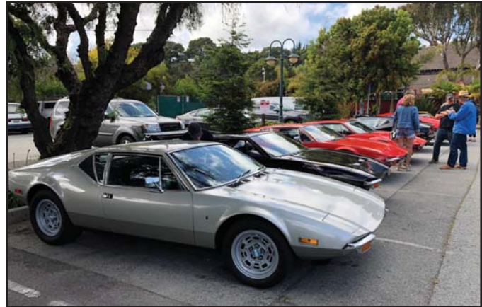
Pantera row fronted by Markus Woehler's beautiful '72