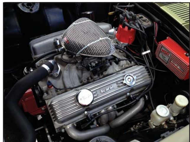
Few people have ever seen a genuine Scarab, but there was one at Baja Cantina! A few hundred were built in the 1970s by stuffing a Corvette V-8 into a heavily beefed-up Datsun 240Z. The resultant car would easily eat a Pantera's lunch!