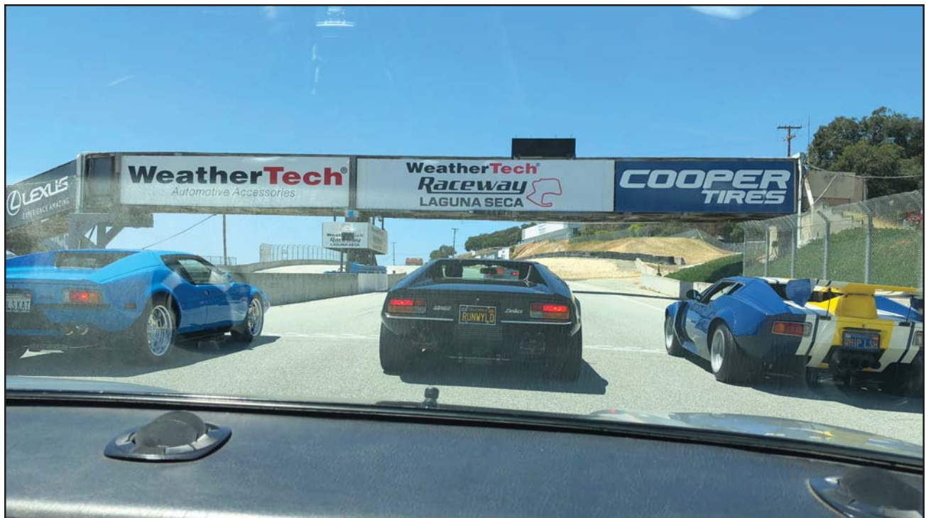
Panteras lined up three-abreast on the front straight for a few thrilling laps of the legendary Laguna Seca race track