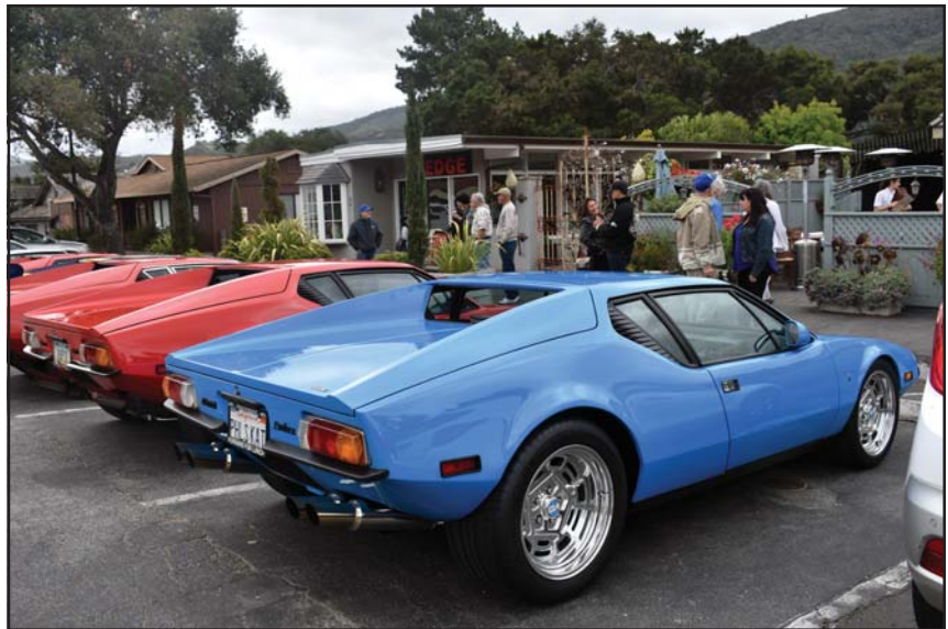
Phil Camp's beautiful '72 Pantera heads a line of cars outside Cafe Rustica

The following morning, we emerged to discover quite a few more Panteras had arrived. After a very leisurely morning, at 10:00 a.m. Lori climbed behind the wheel of her Pantera and led a convoy away from Monterey, up and over the spectacular Laureles Grade Road and then up Carmel Valley Road to the tranquil hamlet of Carmel Valley. The plan called for us to have lunch immediately, but this proved to be difficult initially because we arrived at about 10:30 and most restaurants didn't open until 11. We were fortunate enough to encourage one to open early, and soon we were seated on an outdoor patio. The kitchen staff could easily have been overwhelmed by a large group showing up more or less unannounced, but fortunately they were able to look after us without any problems. Besides, we