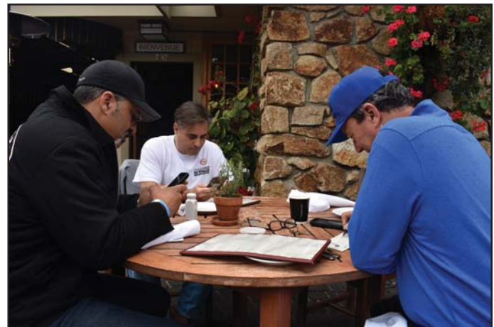
The kids these days....they are supposed to be having lunch together but instead they are buried in their cell phones!

After a European-style leisurely lunch, some drove and others merely ambled up the street to