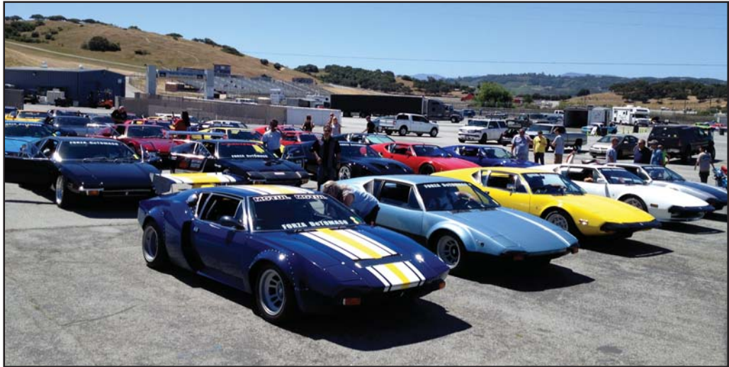
The paddock was absolutely filled with Panteras, headed by the Adler's famous "Whiplash" Group 5 race car, built in Belgium from a converted factory Group 3 race Pantera and later converted for street use

On Saturday morning, donuts and coffee were served in the hotel parking lot, before the group (even larger now) set off for Laguna Seca. Once again the SCCA allowed us (for a