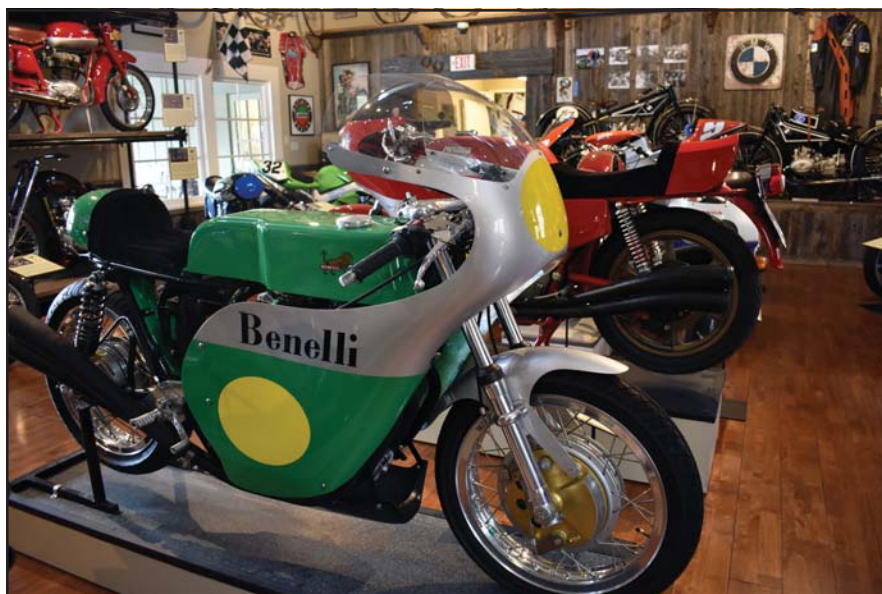
This lovely Benelli 500cc four-cylinder racer dates from the days when Alejandro de Tomaso was running Benelli, among his other business concerns

the Moto Talbott Motorcycle Museum, which is arguably one of the best motorcycle museums in the world. After soaking up the atmosphere, and admiring the wide and varied range of motorcycles on display, on their own people slowly filtered out of town for the eight-mile drive down the road to the Baja Cantina.