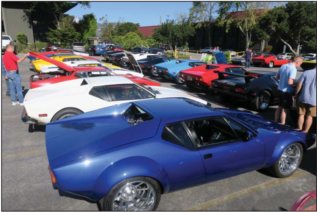
With little historical perspective, there was no way to know how successful this first-ever event would prove to be. Fortunately people came from far and near to join the fun and the parking lot was filled with Panteras