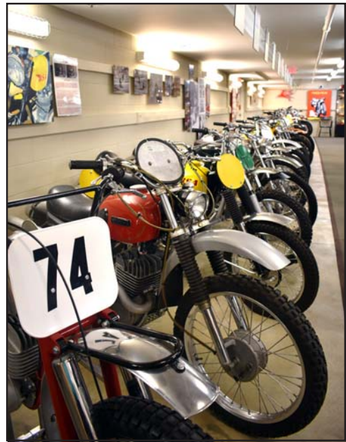
Motorcrossers typically lead very hard lives, so seeing a lineup of immaculate 1960s and 1970s motorcross bikes is a rare treat indeed

ourselves parked in between a pre-war Packard and a hot rod, with a lifted 4x4 just over there, and a beautiful Lamborghini Espada not far away.