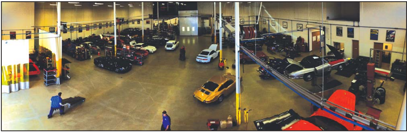
The huge restoration facility was filled with cars undergoing everything from a routine service to a ground-up restoration, and from one end to the other it was spotlessly clean