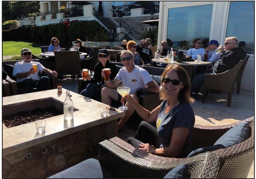
The rarefied air of the Pebble Beach Lodge proved welcoming to the Pantera crowd, and we enjoyed some rather expensive cocktails while admiring the view

We then continued south, and soon found ourselves on the famous 17-mile drive for a gentle, scenic drive. Ambitious plans for a group photo shoot of all the cars proved difficult to realize