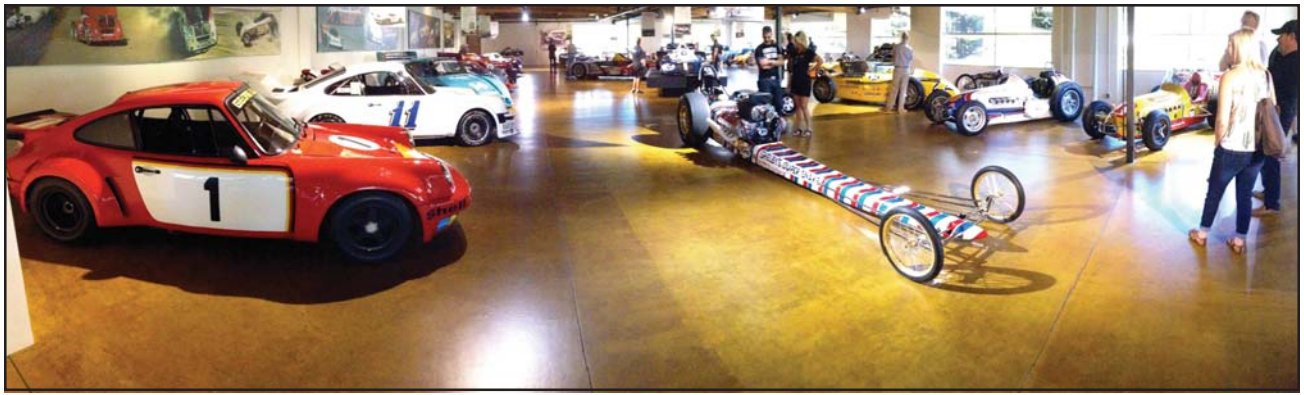
The Canepa museum was rather Porsche-centric (with not one but two examples of the legendary 917, among many other examples of the marque) but also had a tasty collection of USAC dirt cars, and even a Shelby dragster

bumping into people and chatting. Even though lunch was delicious, it was also rather early, so we were hungry for dinner relatively early, which was convenient because the place really fills up quickly. Most of us found our way inside and enjoyed a terrific Mexican dinner, and then eventually retired to the hotel, where others were hanging out in the de facto hospitality suite, the hotel's sports bar.