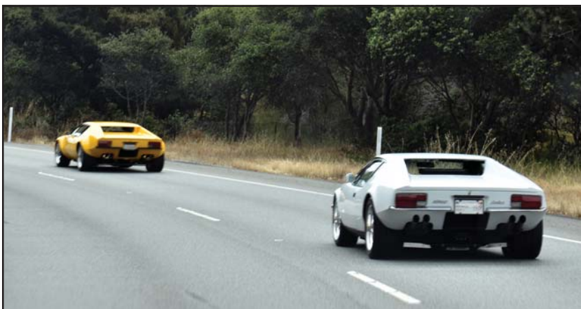
Panteras on the way to the fantastic Laureles Grade