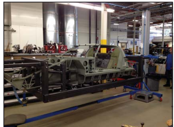
Discovered in a suburban garage under piles of junk, this multi-million-dollar original GT40 is now being restored