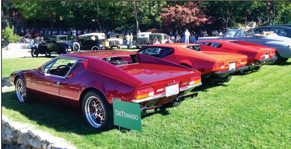
The De Tomaso contingent was blessed with its own reserved parking area, although decreased numbers of marque participants meant that non-De Tomaso interlopers were introduced into the mix