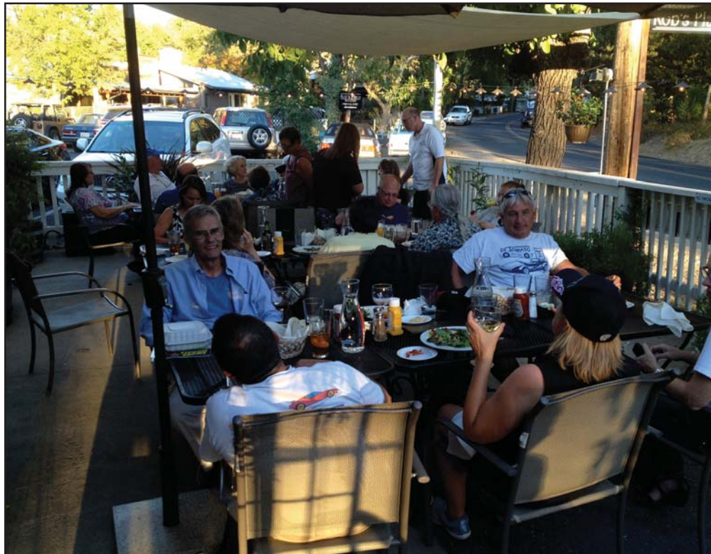
At the end of the day, we enjoyed a delightful meal while watching the show cars drive past

treated to the sights and sounds of many of the concours entries driving past as the owners prepared to depart the area.