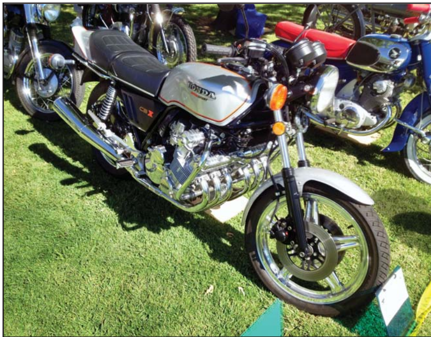
When De Tomaso owned Benelli Motorcycles, in the mid-1970s he had his engineers copy the design of the Honda 500-4 and graft two cylinders onto the ends, to produce a 750cc six-cylinder motorcycle called the Sei. Honda followed suit by grafting two cylinders onto their 750cc four, to produce the 1979 Honda CBX 1000. These have become incredibly collectible in the past few years