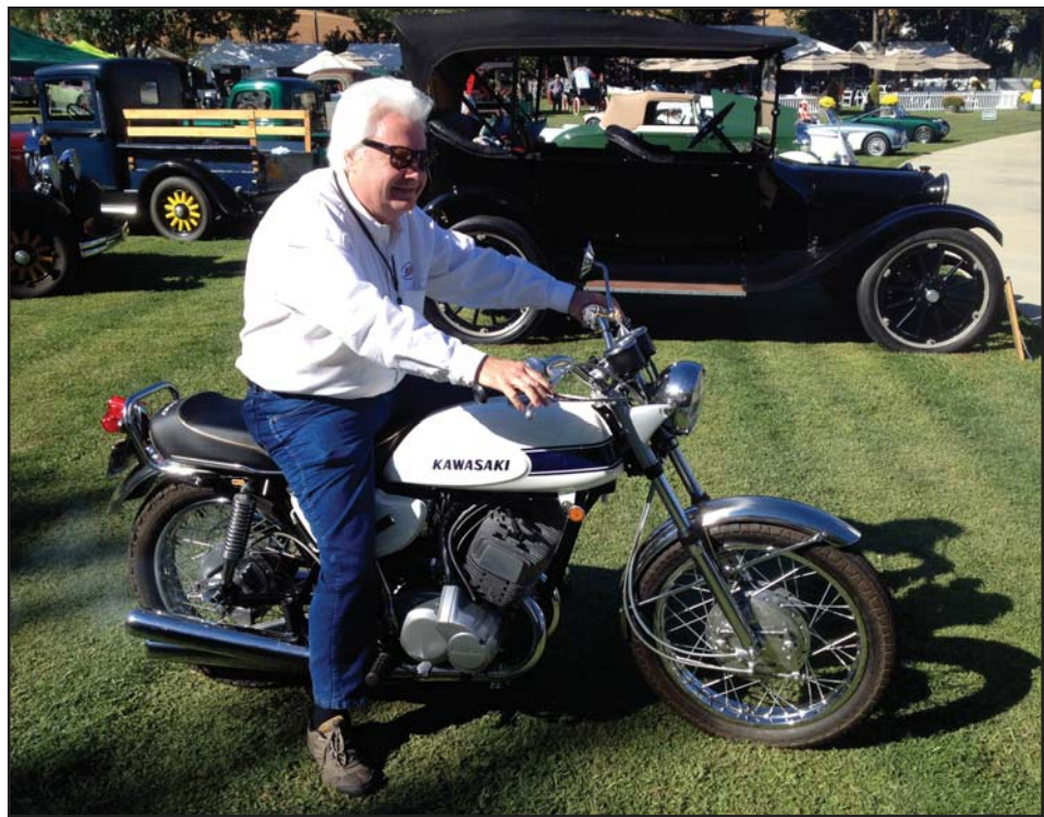
Nobody was more cheerful than this fellow, happily reliving his youth aboard his beautifully restored Kawasaki Mach III 500 triple that he bought new in 1968!

Following the concours, after a bit of freshening up back at our respective places of lodging, the group reconvened at Rob's Place, a restaurant on the edge of town that boasted a delightful outdoor patio seating area perfectly sized for us. We were positioned right alongside the road leading out from the concours grounds, so besides enjoying great company and fine food, we were