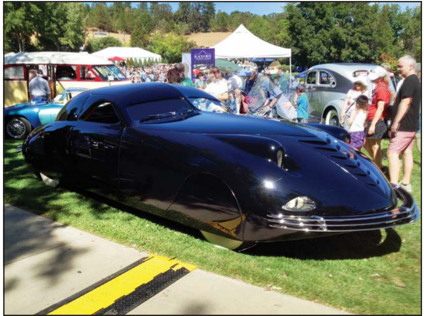
The incredibly futuristic Phantom Corsair, from the National Auto Museum

joined Garry, leaving Sue and Lori to lounge about until a more reasonable hour of the morning. We rolled into the show grounds and were directed to a premium spot, much closer to the main stage than in previous years. While this show normally has an extremely broad variety of cars and motorcycles from all eras, De Tomaso is