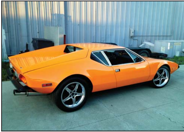
XXX XXXXX's Pantera is rarely seen south of the Golden Gate Bridge, but light traffic easily justified bringing it