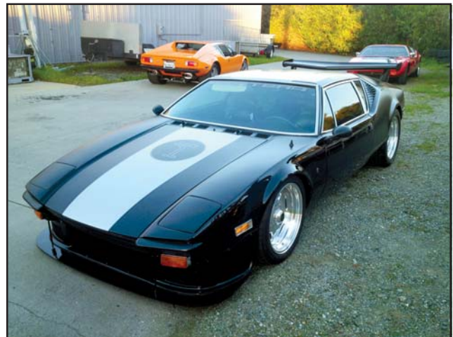
Gary Kono's Pantera looks more formidable each time it comes out. The front splitter is practically on the ground; fortunately he has an air-jack system to clear steep curbs