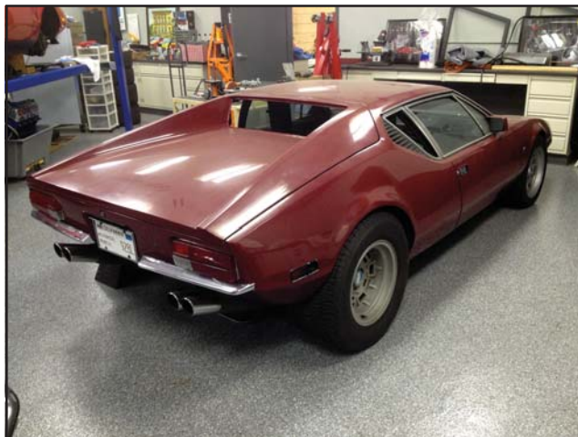
Mark McWhinney's Pantera, looking forlorn and sorry for itself. It only needs to have the intake manifold, carburetor and one valve cover installed to be a runner!