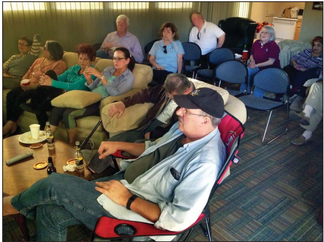
Some club members were utterly transfixed by the game (and the commercials!) while others seemingly had no idea a game was even taking place!