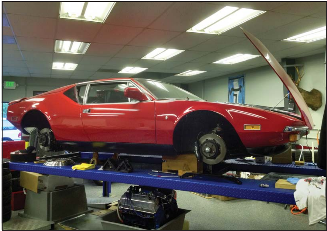
Brent Stewart's Pantera was up on blocks, getting a new brake system installed. Underneath is a full-race 351 Cleveland that he bought just for the hell of it. Now he's looking for something to put it into!

diately, as the headliner (which was already falling down, and held up with electrical tape) collapsed on top of both of them, completely blocking the view