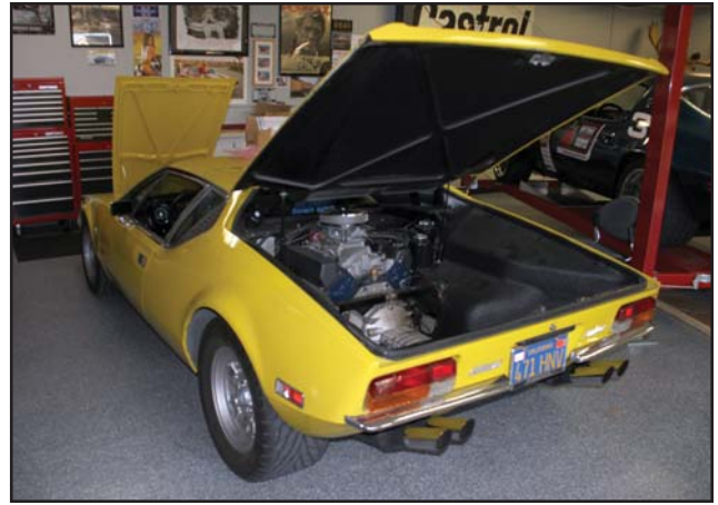
Garth Rodericks boldly disabled his car by ripping out the fusebox, but amazingly it all went together flawlessly

to the rear unless Ken held it up with both hands. A strange clicking noise/feel from the steering system was worrying, but after several people investigated, it was determined that the wheel itself was rotating slightly within the hub, apparently because the mounting screws weren't tight enough—a simple fix!