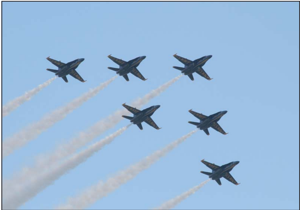
The only things louder than the Panteras were the Blue Angels, who flew right over the shop!

While historically the party has been held at someone's home, last year it was held at Bob Benson's workshop in Campbell, which proved to be a surprisingly hospitable location. Besides having a big TV and plenty of sofas and chairs, it also has lots of room for tables for dining, and significantly, a number of lifts and piles of tools to accommodate those more interested in working on Panteras than watching people chas-