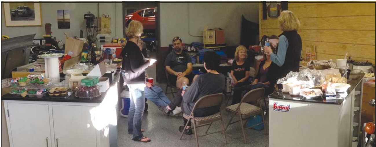
Some folks positioned themselves strategically to be surrounded by all the food! The PCNC store was on display too

Fortunately, nothing could have been further from the truth. Simply put, the number of people who drove to the