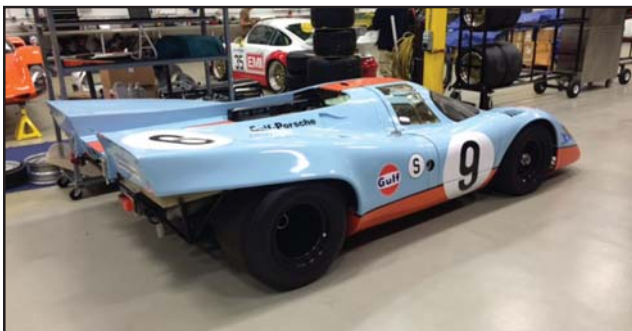
This Gulf Porsche 917 is for sale, and can be yours for a cool $25 million!