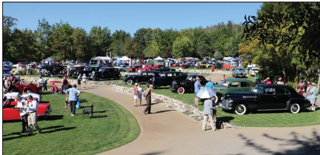
The pastoral grounds of the Ironstone Winery make a perfect setting for a concours

Randy and Linda Welch had arranged for a banquet room for our group at Grounds Restaurant in town. While some drove the short distance, most chose to walk as the weather was just perfect. Quite a few more people joined us, making for a group of 24 people.