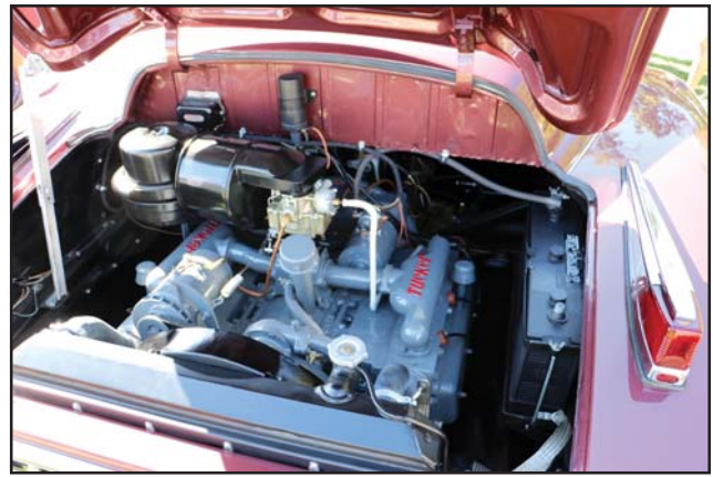
The Tucker 48 was a cutting-edge design, easily ten or twenty years ahead of its time. Sadly the company was underfunded (and some say the victim of a conspiracy by the Big Three domestic automakers) and only 51 were built. The flat six engine was a modified Franklin air-cooled helicopter engine, converted to water cooling