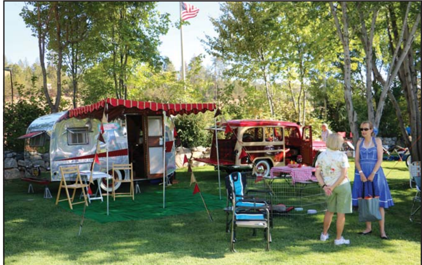
Nobody was having more fun than the vintage camper trailer folks. A dozen or so were gathered together in a corner of the facility, and they were all being towed by suitably vintage cars

divided into a seemingly endless number of classes, and besides the tradi-