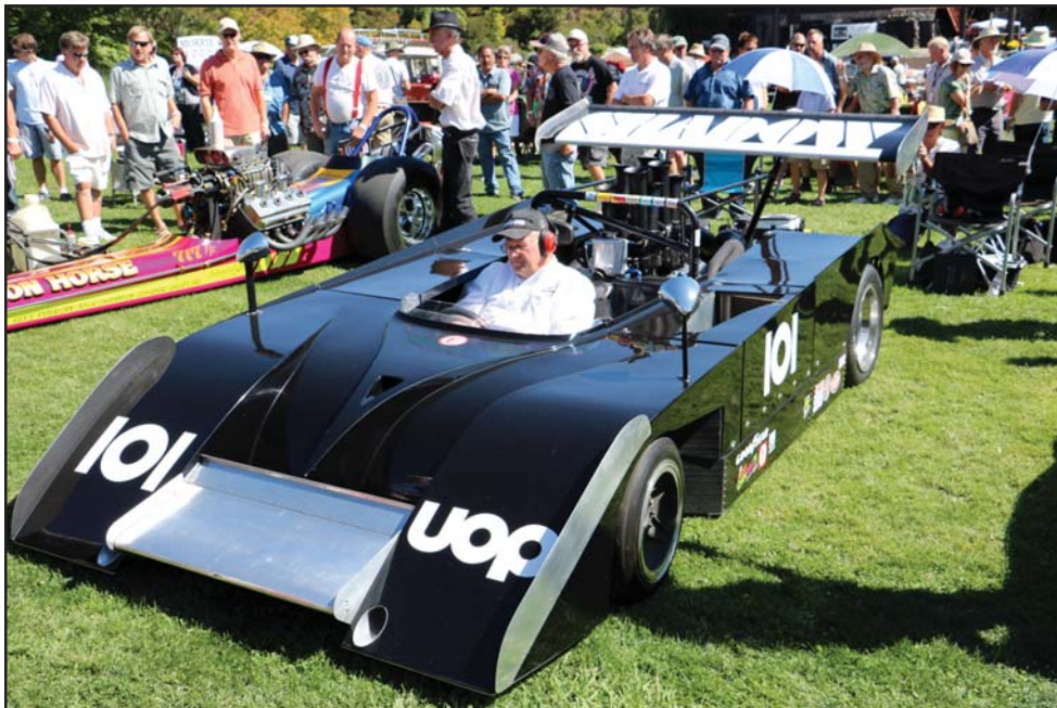
The noise made by the Shadow Can-Am car during the cacklefest portion of the festivities was spectacular; the dragster behind it was positively epic!

Near the end of the day, a "cacklefest" broke out in the race car area. There, the Shadow Can Am car and a front-engined rail dragster were started up and run for a few minutes. The dragster in particular was astonishingly, earth-shatteringly loud; one could literally feel the ground move when the mechanic blipped the throttle. It