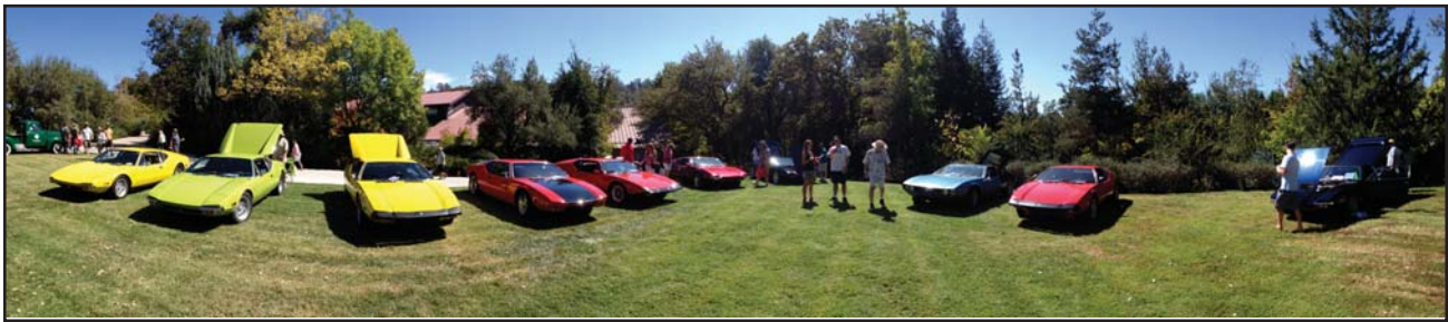
A panoramic view of the cozy, intimate De Tomaso area

Dinner went long into the evening as the conversations flowed as freely as the wine. It's a good thing most of us walked instead of drove!