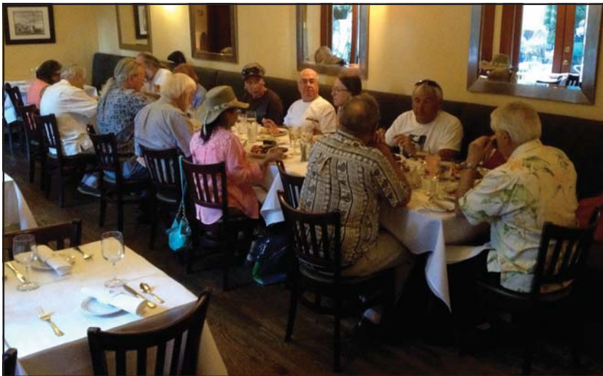
The first night saw 24 club members gathered for a terrific dinner

Besides having an amphitheater which plays hosts to numerous big-name musical acts throughout the year, Ironstone has also become the scene of a surprisingly good concours. There are a lot of truly special cars housed in northern California, to include numer-