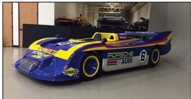
This Sunoco Porsche 917/30 Can Am car boasts twin turbos and makes a shattering 1400 horsepower!