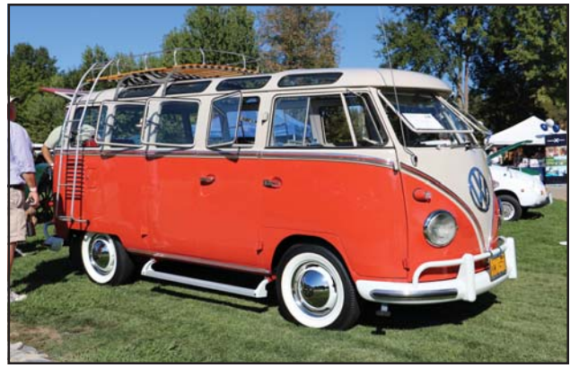
VW 23-window buses like this one have exploded in popularity, and inexplicably are now bringing more than $200K at auction!

The next morning, people set off in different directions at different times. We were among the last to leave, and