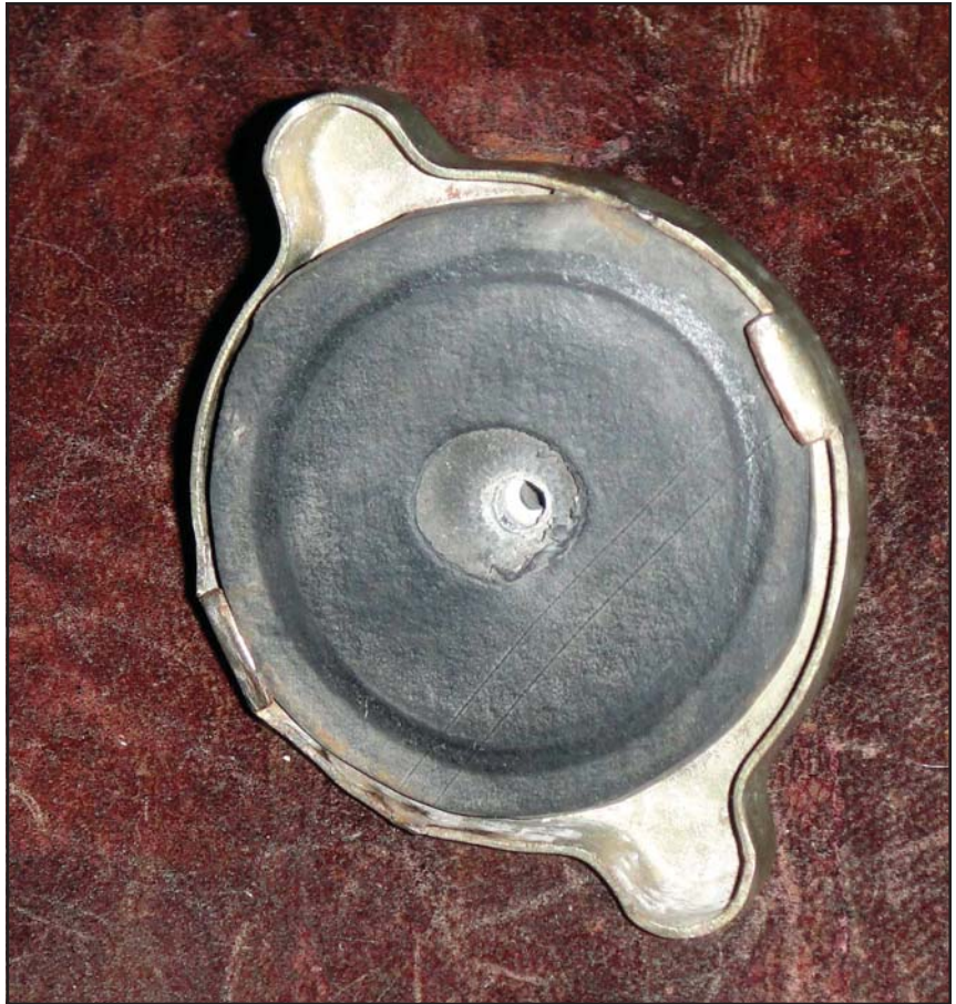
The innertube is cut out to perfectly match the inside contours of the cap

Of course, this also makes it possible to explode a cooling system if too much pressure is applied! In the case of our Panteras, I pressurize the swirl tank and put the regular pressure cap on the reservoir, thereby limiting the amount of pressure that the cooling system sees. As long as the regular pressure cap is working as advertised, it