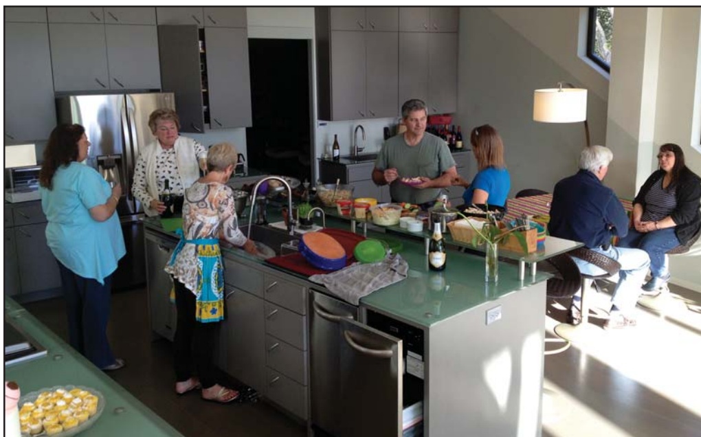
Naturally enough, the kitchen proved to be the social epicenter of the party

Todd soon took up station at the grille,