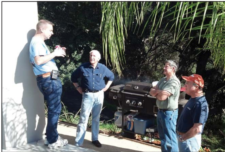
Just as in ancient times, men seem to gravitate around the cooking fire....

(Well, except for ours of course—mine still has a missing U-joint in one