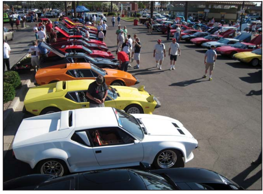
The car show was terrific...or so I heard!

That concluded a thoroughly enjoyable four days with one of the best groups of people imaginable. The facility and the staff were impeccable. POCA and the Pantera Club Of Arizona deserve an enormous THANK YOU for the huge amount of work that they put into this event. It was GREAT!