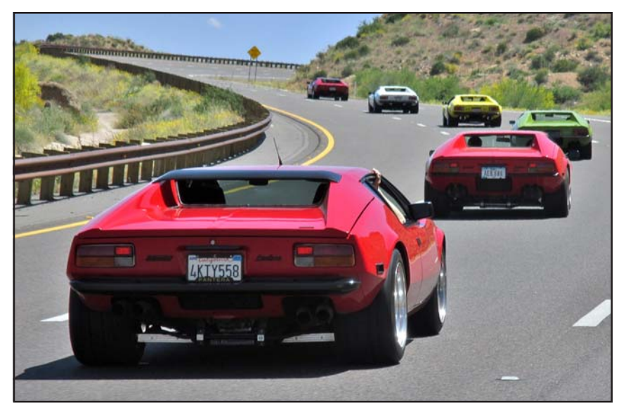
The Panteras travelled in convoy on the way to Payson

Another group, including many of the PCNC people, drove to the Commemorative Air Force museum in Mesa, where we saw a nice collection of American, British, and Russian military planes dating from the WWII period to modern times. All of the planes at this facility are certified and in proper flying condition. Some were undergoing maintenance procedures as we watched. We had fun sticking our noses in every hatch and open space we could find. We crawled through the cabin of a B-17 (it's a little tighter than it looks in the movies). They even fired up one of its radial engines for us (it was almost as loud as Darryl Johnson's car). Then it was on to an excellent lunch at a nearby Mexican Cantina. After lunch there was a decision to be made. Go back to the air-conditioned comfort of the hotel with its pool and hospitality suite? Or go to the shade-less, triple-digit-temp asphalt of the track to watch Bob win his class? While I was standing in line at the bar in the hospitality suite pondering my problem, I decided that the risk of getting lost out in the middle of the