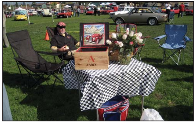
Some people know how to go in style! These folks were rolling with fine wine and fresh-cut roses....