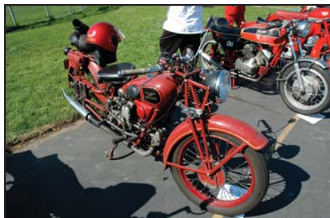
Italian motorcycles, like this old Moto Guzzi, are a big part of the show as well