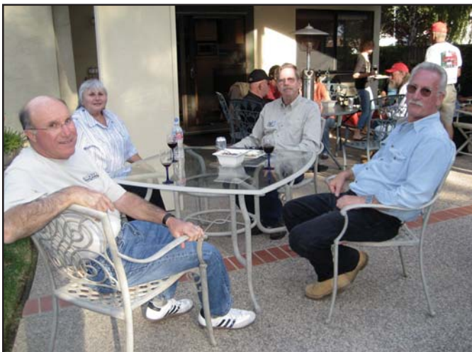
The Dalcinos hosted a delightful after-party to cap off the day

Finally we all hit the road, and made our way to the Dalcinos, happily finishing off yet another wonderful Pantera day with fine food and great friends. Oh! And driving straight from the airplane, Mike did make it to the party, still wearing his flight suit!