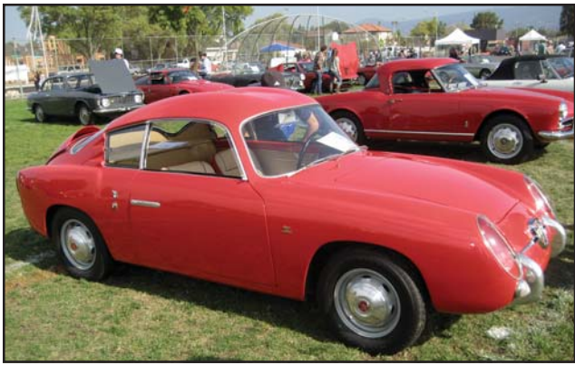
This 1958 Abarth Zagato 750 has a distinctive 'double-bubble' roof and is powered by a tweaked 750cc Fiat