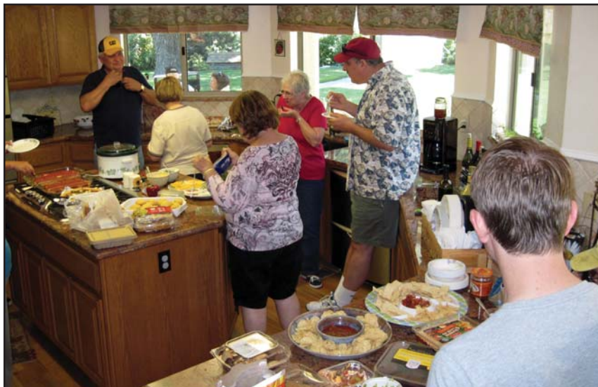
The kitchen was packed with food, and people!