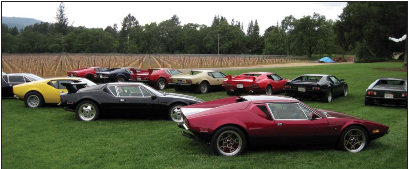
As the shadows grew long, the Panteras were parked on the lawn of the Chateau St. Jean winery