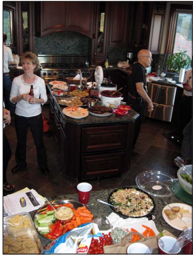
The kitchen was absolutely filled to overflowing with incredible food of every type and description, including several types of chili, cookies, pies and cakes!

marked the tenth year since they sold their Pantera. Despite this, they maintain their ship, and it’s a