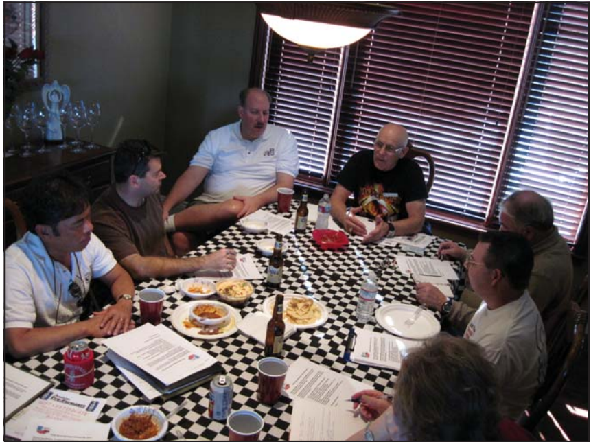
The members of the PCNC board discussed the upcoming year