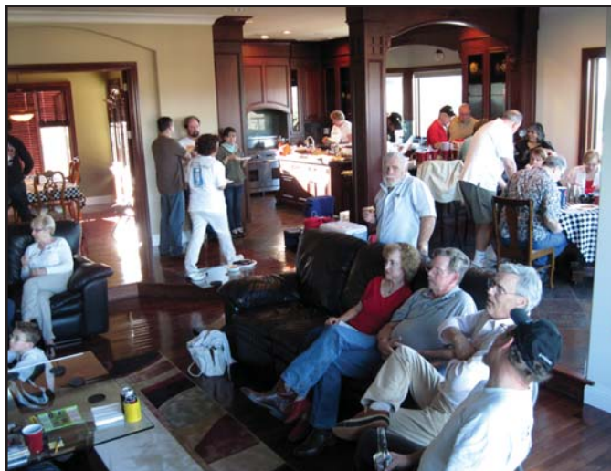
The Stewart's home was open and inviting, and club members were scattered throughout the place

spread out in various places — a grille was going on the patio outside, many people were watching on the big-screen TV in the family room, or orbiting around the kitchen. Elsewhere in the house was a kid's entertainment room with its own big-screen TV, and this proved to be a popular spot as well. And of course the gearheads hung out in the garage and driveway; the garage was suitably equipped with a big TV too!