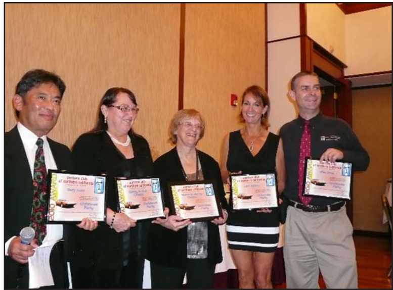
The committee that put in all the hard work to stage the Christmas party; many other people volunteered on the day to help set up the room