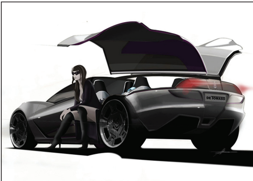
It never hurts to have a power-babe incorporated into your marketing strategy! This drawing shows how the gullwing doors would open, and allow access to not only the engine compartment, but also the back seats

• The Ghepardo measures a length of 4820 mm, a width of 1970 mm, height of 1300 mm and a wheel base of 2990 mm.