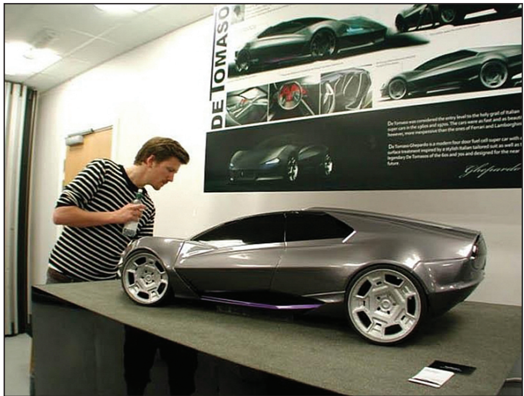
The freelance designer of the Ghepardo is a Dane named Fredrick Tjellesen. All the images here were taken using this 1/4 scale model and photographic tricks

De Tomaso concept (SEPTEMBER 2010) The four-door sports car, Ghepardo, suggests the new concept for future De Tomaso. As the sportiest alternative to the growing number of exotic