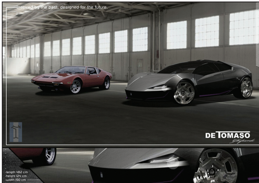
The ties to the Pantera design are subtle. Oddly, one of the strongest connections is the wheels, yet while the concept uses early Pantera-styled wheels, the Pantera in the background is equipped with aftermarket Gr4 Pantera wheels?

• It represents speed, aggression yet elegance through its surface treatment, stands, volume and details such as tensioned lines and integrated spoilers creating active down force.