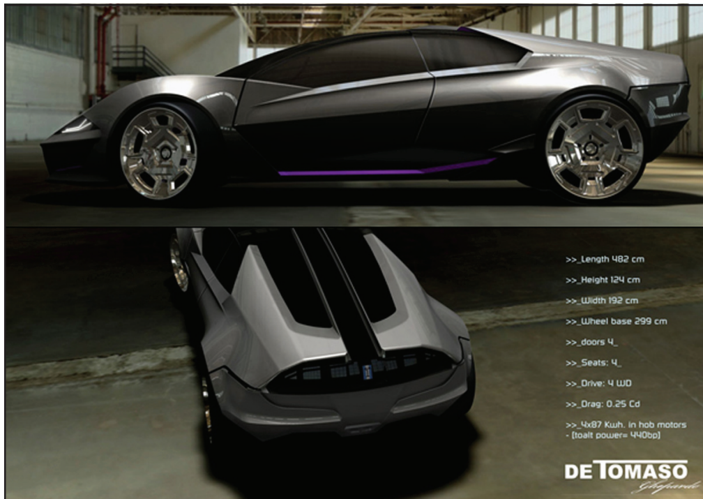
The gull-wing engine hatches double as the rear doors, and are the strongest Mangusta design element appearing in the Ghepardo

• With inspiration from the Mangusta, the large rear gull wings function as both rear doors as well as boot lid.