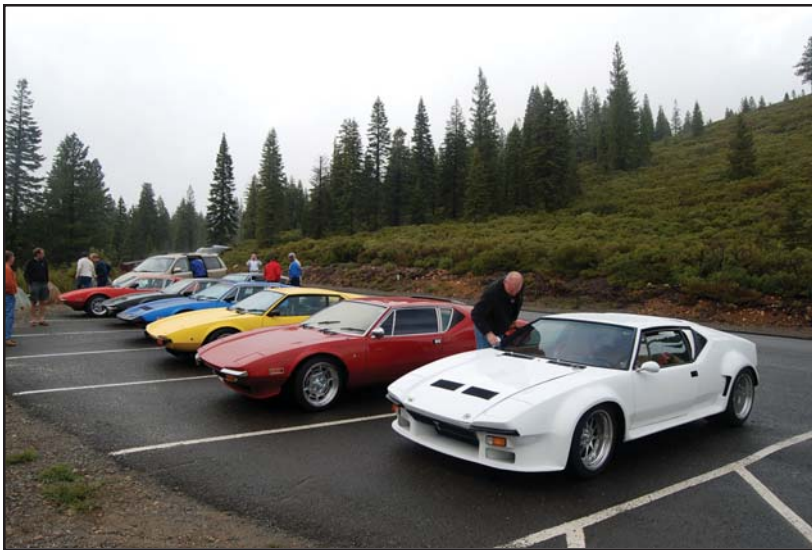
The roads started to dry out towards the end of the 'spirited drive'