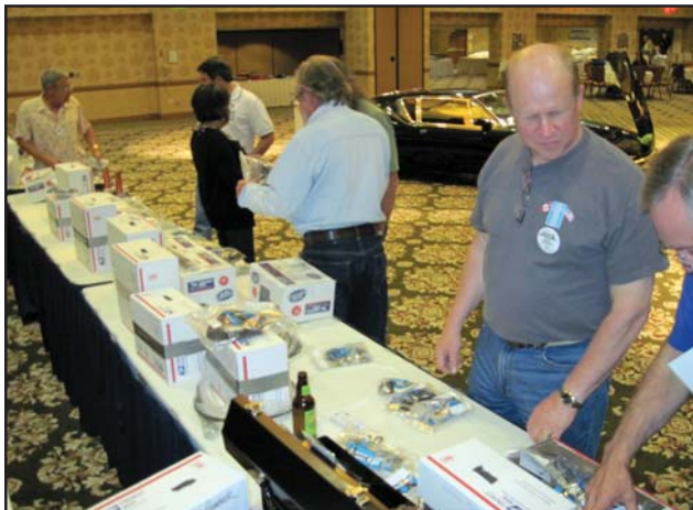
The raffle prizes were amazing this year, and led to POCA's greatest-ever raffle ticket sales!

In the afternoon, Pantera International hosted a Go-Kart and Pizza event at a track in Reno. With the loss of the track event, most of the speed-addled crew signed up for this as a substitute. Although there was some skepticism among the truly hard-core, all were shocked to discover how incredibly fun and competitive the racing turned out to be! Driving on a slick track, it required cunning, skill and more than a bit of good luck to get around cleanly even once, much less lap after lap. A pile of pizzas and sodas made the night