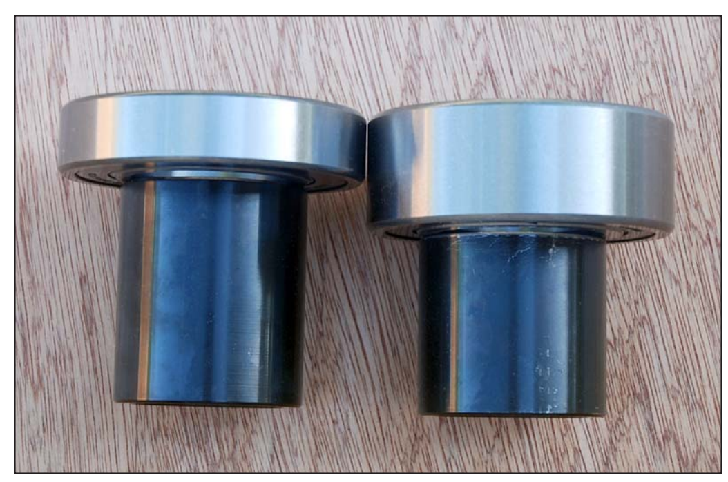
The relationship between the stock setup on the left, and the replacement bearing on the right, is immediately obvious. The potential benefits vastly outweigh the nominal cost increase

Many years ago, Dennis Quella and Marino Perna both pioneered a fix in the form of a conversion to tapered roller bearings. These bearings are better suited to the task at hand, and have a greater surface area. Although this is the best-quality fix for the problem (new axles are always required at the same time, assuming the assembly is taken apart due to wear issues), it is prohibitively expensive, as the job requires much custom machining of