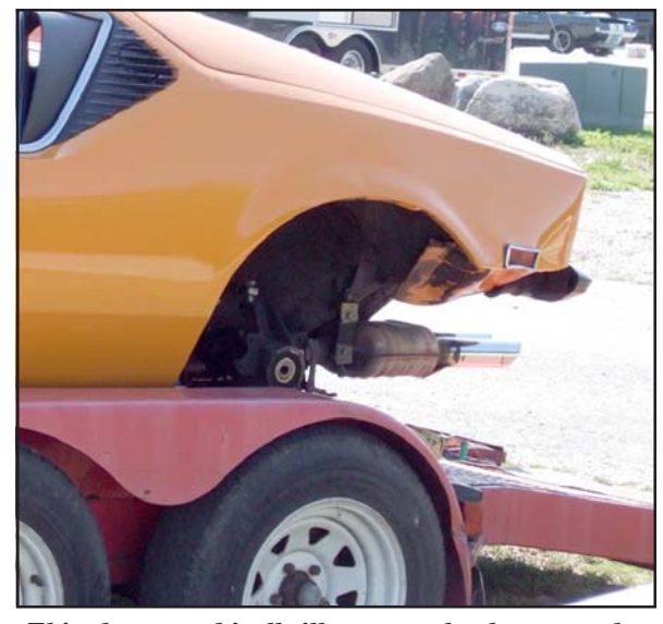
This photo graphically illustrates what happens when axle wear goes undetected and unresolved. Close examination of the photo reveals the wheel bearing, plainly visible, with the snapped-off axle stub still inside.

When larger, heavier wheels equipped with much larger and stickier tires are factored into the mix, the result is unwanted wear. Many a Pantera suffers from the insidious problem of the wheel bearings wearing grooves in the axles.