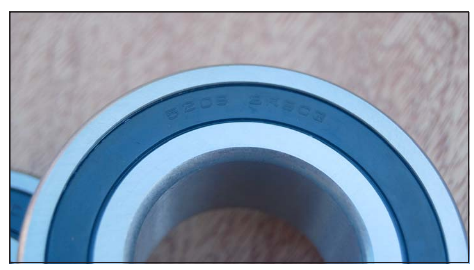
The bearing number is molded into the rubber seal

Intuitively it can be seen that these new, wider bearings, coupled with stronger inner spacers should result in greatly increased service life—probably well in excess of the life of the owner!