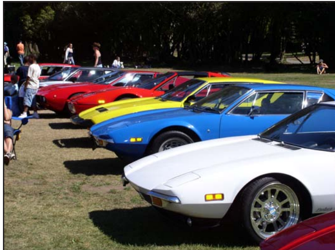
The crowd seemed appreciative of the De Tomaso display alongside the stage. One or two people thought it was okay to hop in!

naturally, we have a car corral next to the stage with De Tomaso and other Italian rolling art.