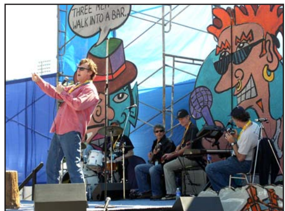
The members of PCNC were given special VIP seating in an enclosed area right in front of the stage, and also enjoyed a fantastic catered lunch and drinks, all free of charge. What a deal!

The person who had prepared our food was a San Francisco cable car operator and bell ringer competitor. At the end of the day, I gave him a ride around the park as a reward. On any other day of the year, “four wheeling” through the park at speed in a Pantera would have gotten us ticketed, arrested, and Tasered, but on that festive day even a speedy round of bum slalom got cheers from the park’s local residents.