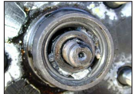
Mike’s wheel bearing literally melted the rollers on the way to the event!

we entered the park and wound our way through to the staging area. The cars were arranged in a line alongside the audience, so everyone in the audience could get a good view of the cars as well