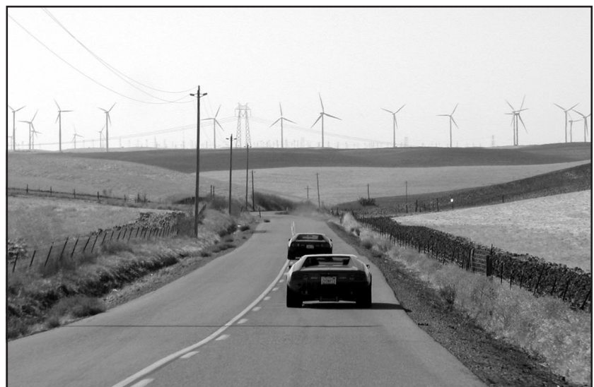
Soon we were way out in the country, alone except for the windmills

This is the fifth year that we have arranged a Fall Delta Brunch Run for the Capitol Panteras and PCNC. This was our best-attended yet. We will plan another one for next year at yet another of the great restaurants that the Delta has to offer. Please plan to join us next year!