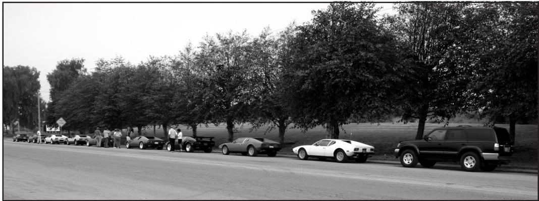
Nine Panteras lined up in preparation for the leisurely drive to Paso Robles