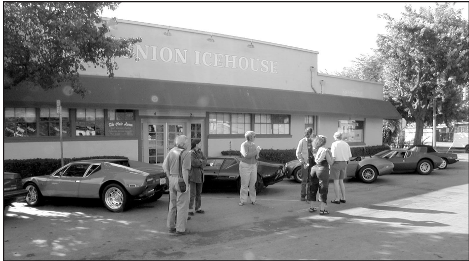
The PCNC group arrived early in a variety of sports cars, and looked to the distance for the arrival of the Sacramento crowd