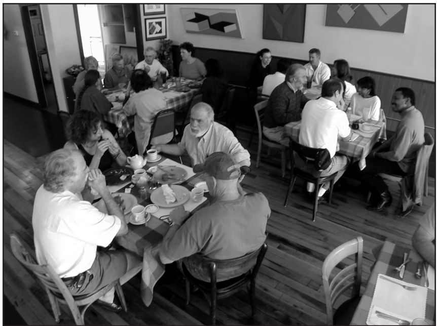
Once inside the café, we enjoyed a terrific feast!