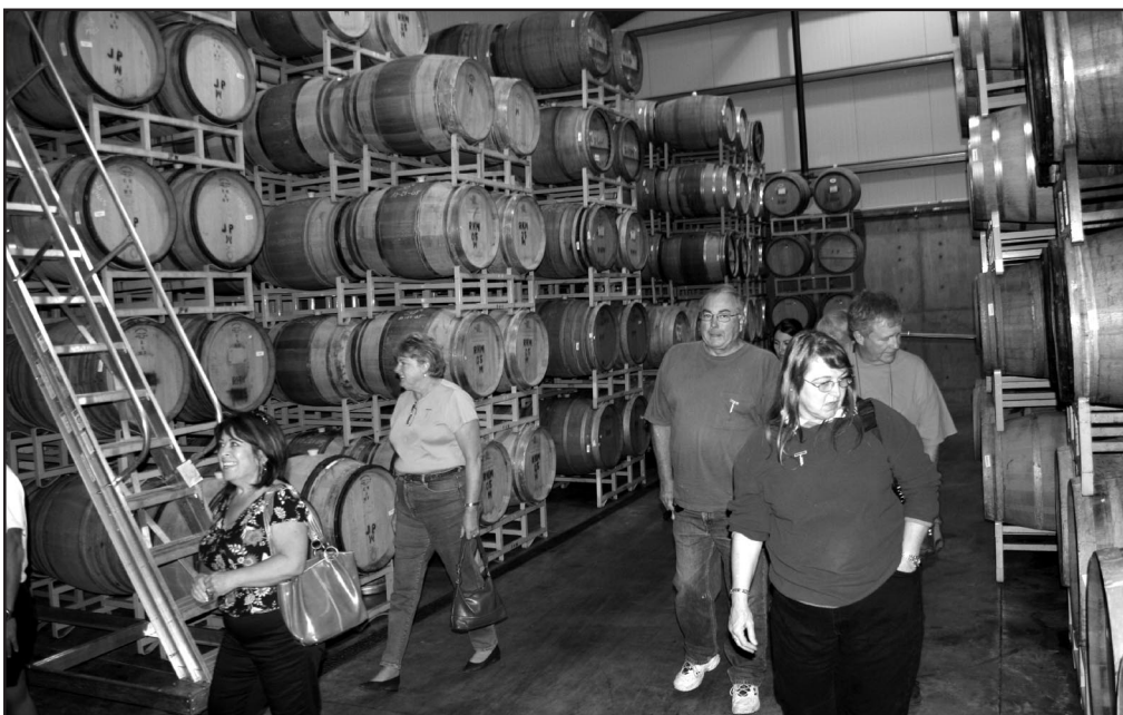
The next day the tours continued as the club enjoyed several more local wineries