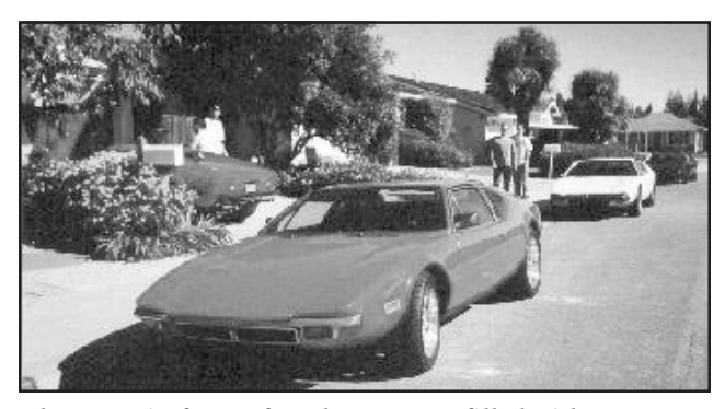
The street in front of my house soon filled with Panteras

We had similar challenges with using a hose of small enough diameter for the bleed screw on the stock slave, and also had air seeping thru the threads. First we tried some MIL-STD thread tape, but it was not impervious to brake fluid. After a quick brain-storming session, we tried some "Indian Head" brand gasket