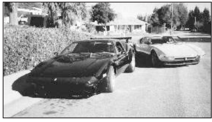
The Panteras all left under their own power after jobs well-done

We finished all the work before 7:00 p.m., drank dessert to celebrate, and called it a night, all jobs well done. Stay tuned for the next event in the Mini-Tech Session Series!